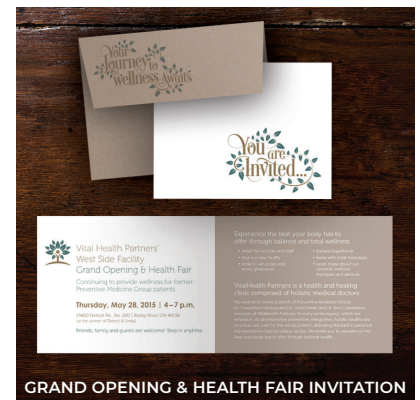
GRAND OPENING & HEALTH FAIR INVITATION