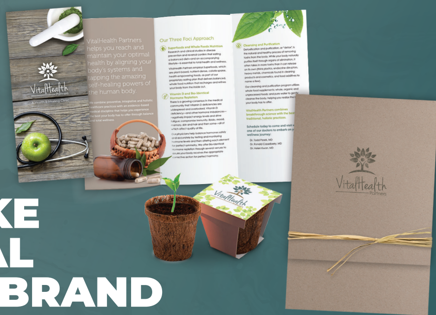
TRI-FOLD BROCHURE, MINI-PLANT GIVEAWAY AND COLLATERAL KIT